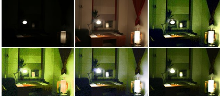
Fig. 4. Office very dark dataset: (Top left) Original Image, (Top middle) Reference Image, (Top right) Dong's method, (Bottom left) HE, (Bottom middle) CEM, (Bottom right) Proposed method