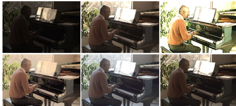
Fig. 7. Piano man dataset: (Top left) Original Image, (Top middle) Reference Image, (Top right) Dong's method, (Bottom left) HE, (Bottom middle) CEM, (Bottom right) Proposed method