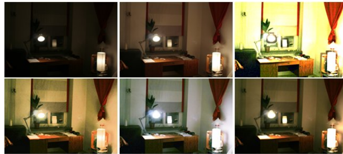
Fig. 3. Office dataset: (Top left) Original Image, (Top middle) Reference Image, (Top right) Dong's method, (Bottom left) HE, (Bottom middle) CEM, (Bottom right) Proposed method

model has provided a noticeable improvement at the image's contrast, but the resulted image is not close to the ground truth ones. We observe that the proposed scheme, reveals sufficient information in the dark parts, without illuminating the already sufficiently illuminated parts.