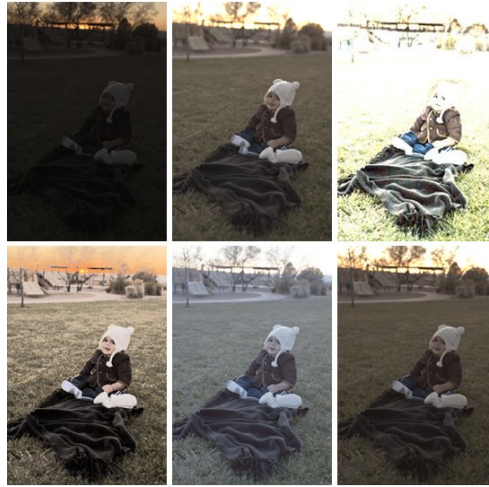
Fig. 6. Baby on grass dataset: (Top left) Original Image, (Top middle) Reference Image, (Top right) Dong's method, (Bottom left) HE, (Bottom middle) CEM, (Bottom right) Proposed method