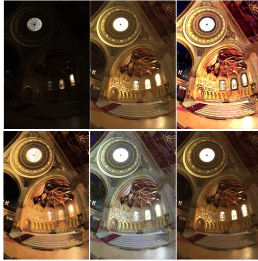
Fig. 2. Memorial dataset:(Top left) Original Image, (Top middle) Reference Image, (Top right) Dong's method, (Bottom left) HE, (Bottom middle) CEM, (Bottom right) Proposed method